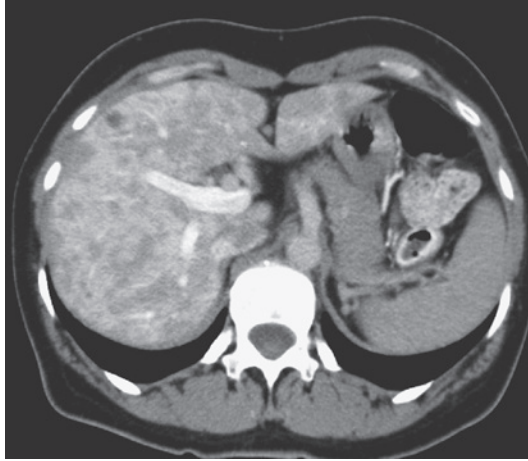
Figure 2. CTAP 検査.